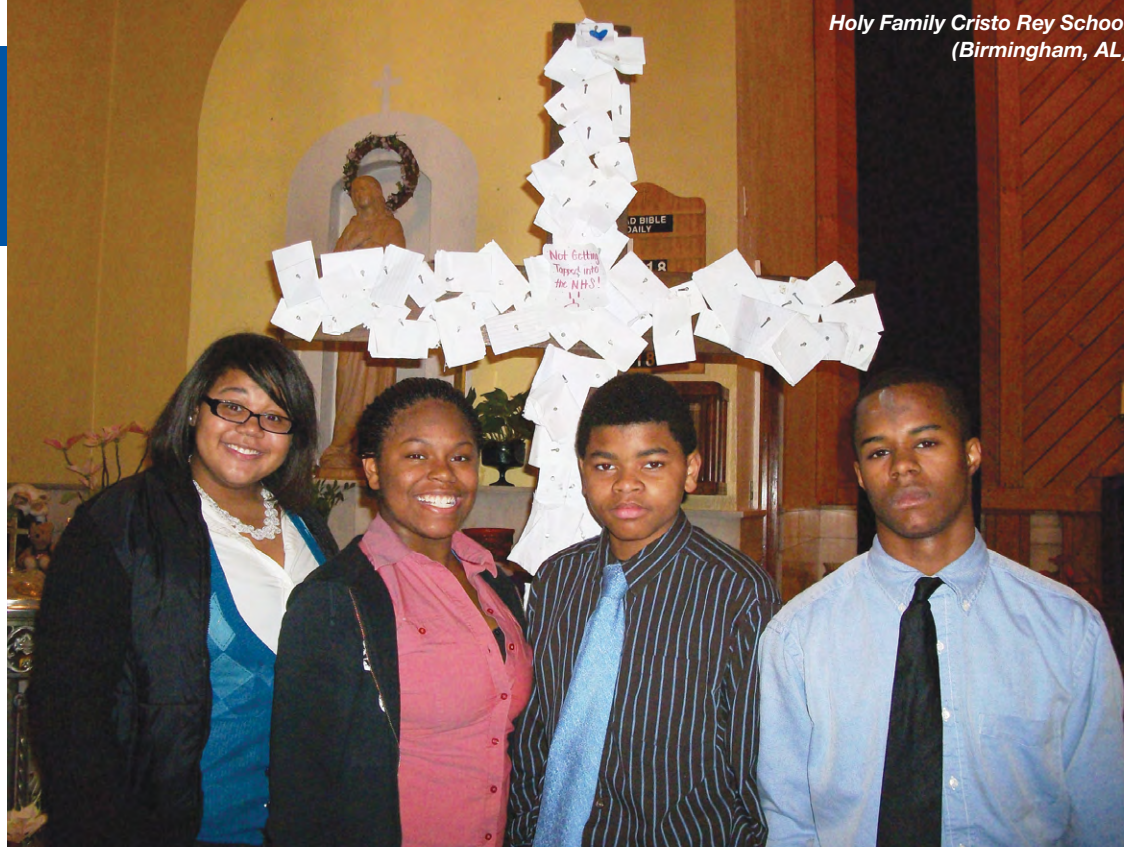
Holy Family Cristo Rey School (Birmingham, AL)

"We want to witness to young people that vocations are possible for Black people in the Catholic Church."