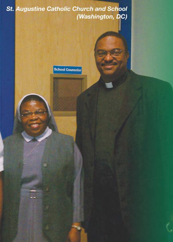
St. Augustine Catholic Church and School (Washington, DC)