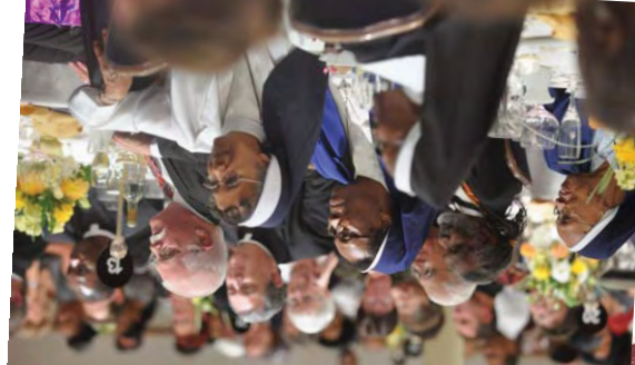
Sacred Hearts of Jesus and Mary (Belcourt, ND)