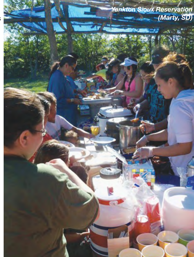
Yankton Sioux Reservation (Marty, SD)

"If we wish to serve God and love our neighbor well, we must manifest our joy in the service we render to Him and them." — St Katharine Drexel