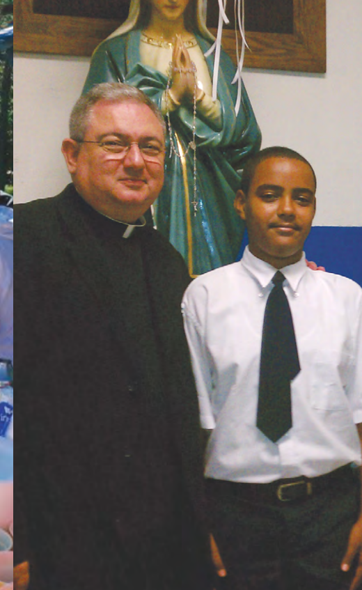
Our Lady of the Sioux Chapel, St. Joseph's Indian School (Chamberlain, SD)