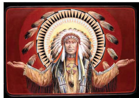
Lakota Victory Christ