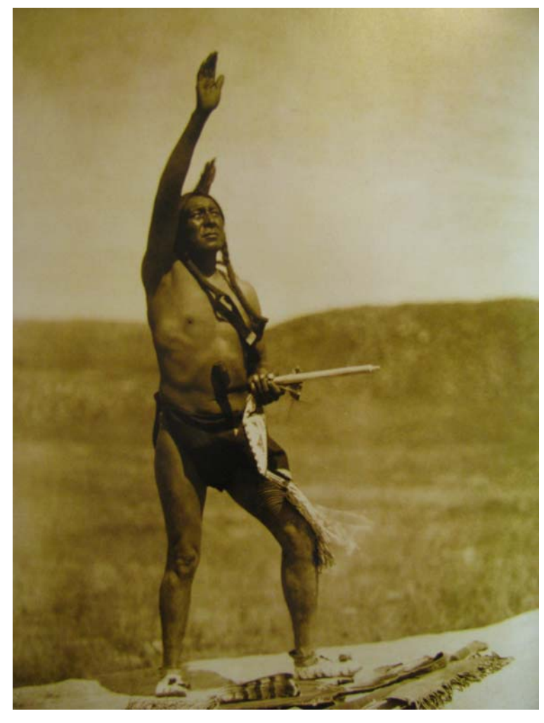
Edward S. Curtis